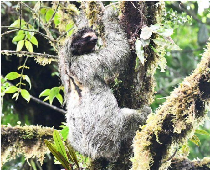
Brown-throated Three-toed Sloth