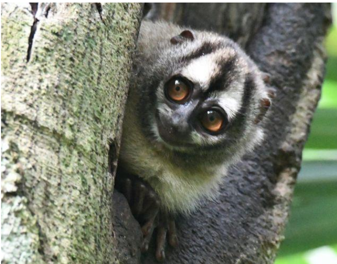
Western Night Monkey