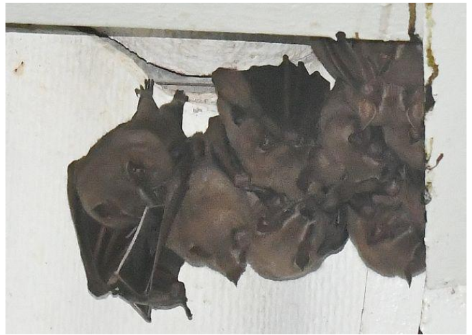
Great Fruit-eating Bat