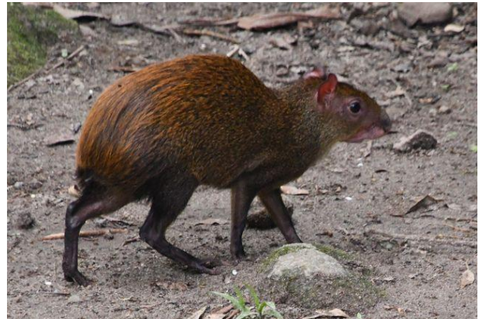
Central American Agouti