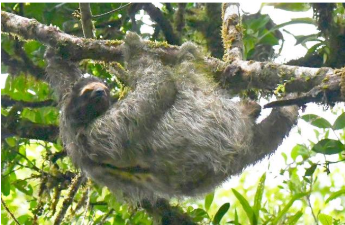
Brown-throated Three-toed Sloth