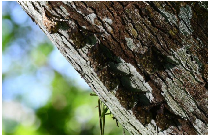
Lesser White-lined Bat