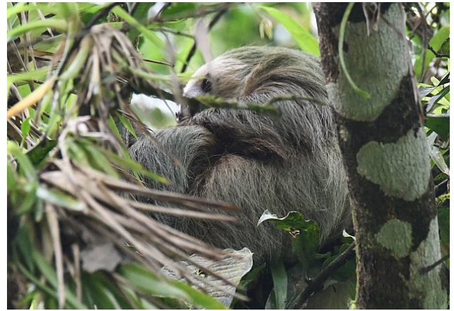
Hoffman's Two-toed Sloth